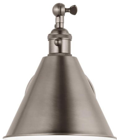
This hand painted finish reacts to light and can vary in appearance. Appearance can range from a dark aged iron to a gunmetal grey.