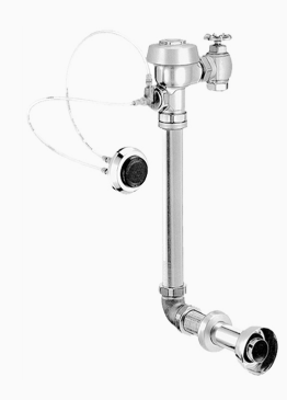
Variation Not Shown: Metal Index Push Button