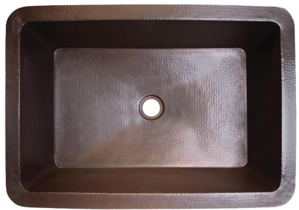
Shown in DB