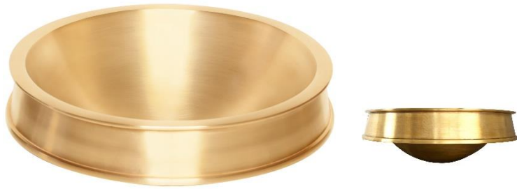
Shown in UB